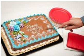
Year #6 is history!